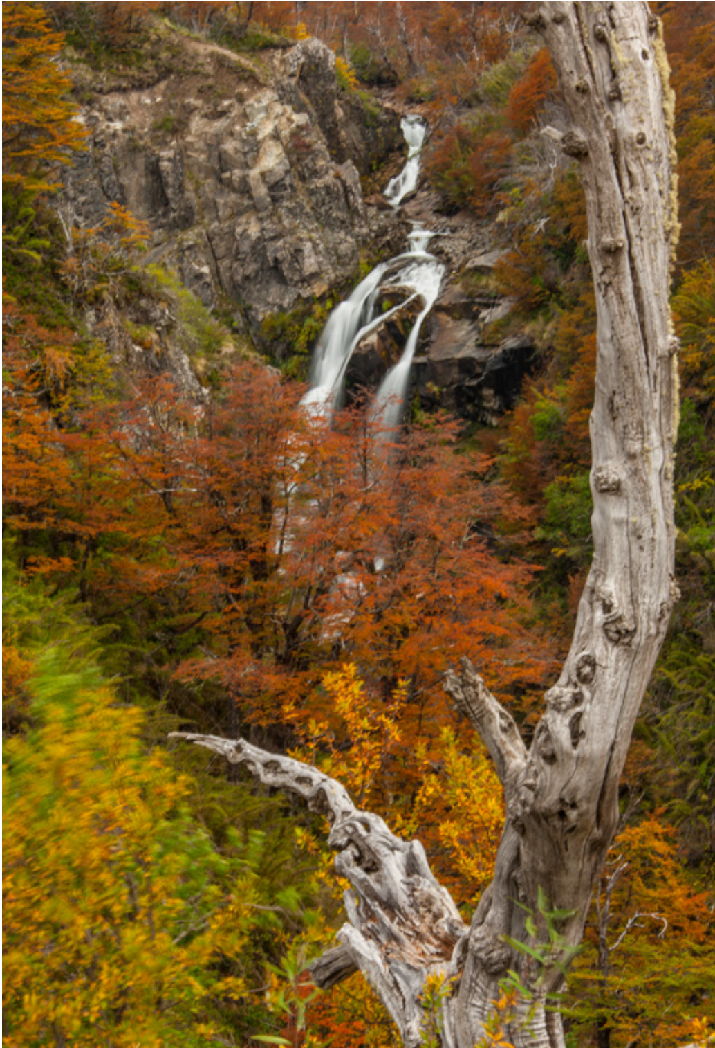
Cascada Vulignanco, San Martin de los Andes