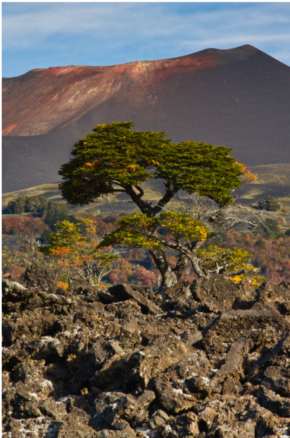
Tree and Lava Rock, Achen Niyeu Volcano