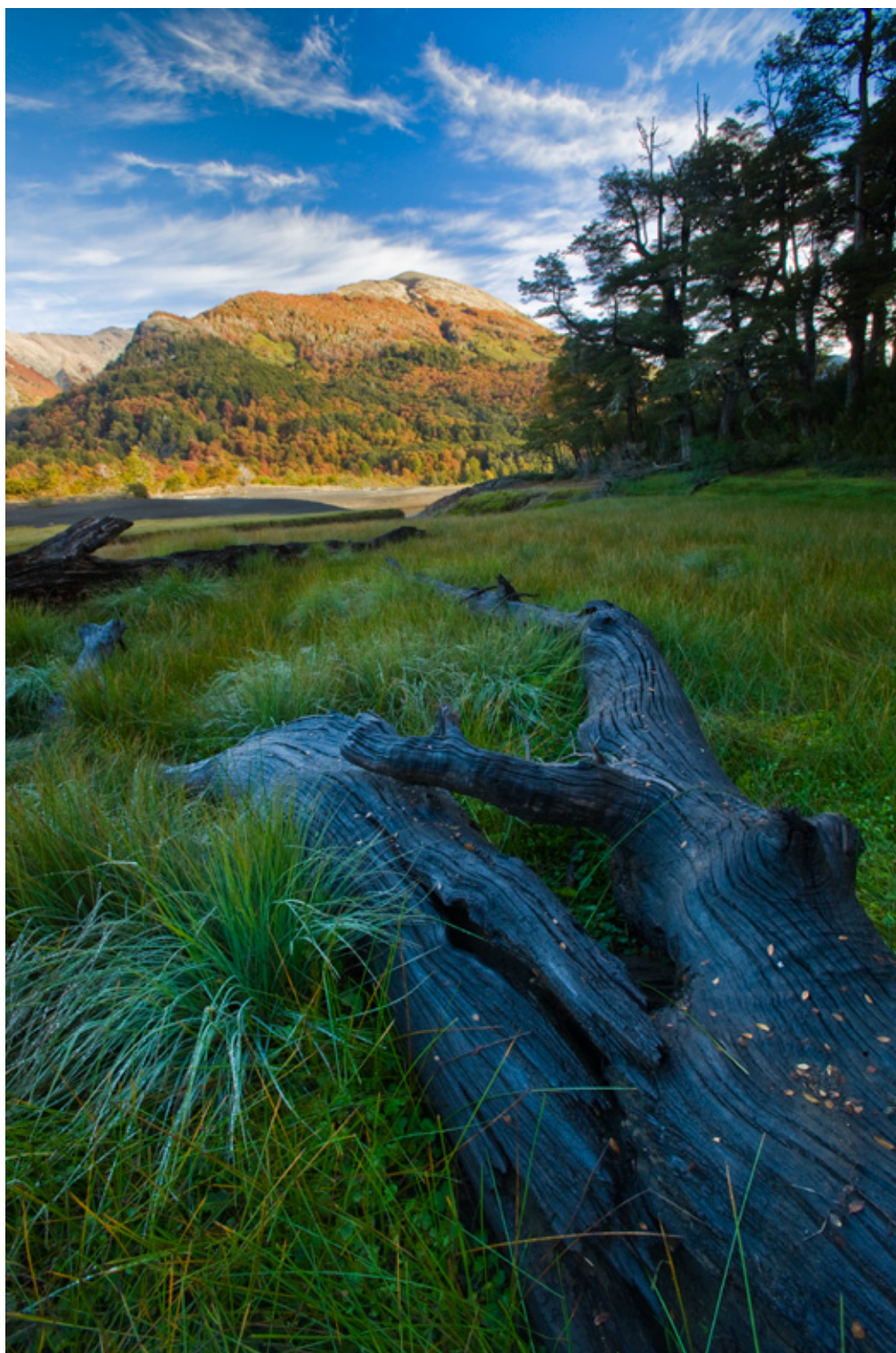
Dead Tree, San Martin de los Andes